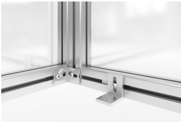
Hassle free installation (corner detail shown)