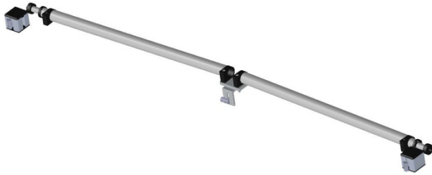
Two arm design for Dual Doors allows for independent door movement