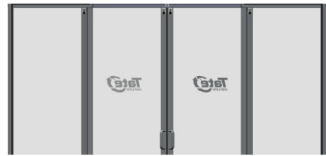
Not visible front the front when doors are in closed position