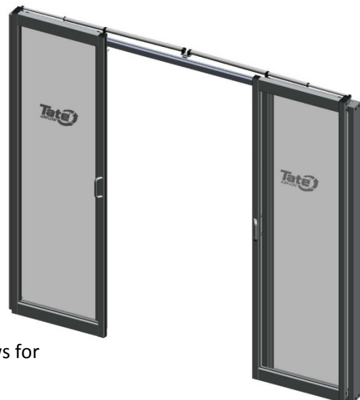
Two arm design for Dual Doors allows for independent door movement