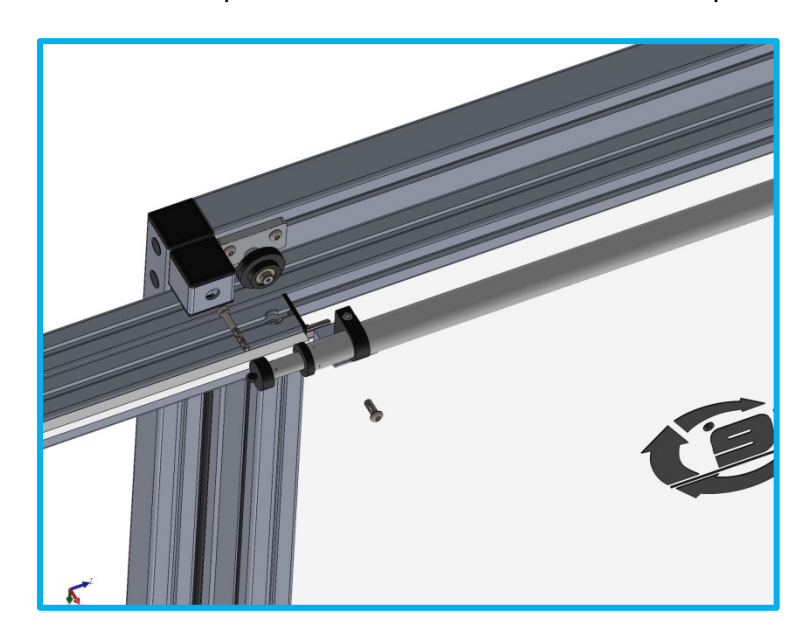
Figure 6 - Auto Closing Assembly Frame Mount Exploded

Attach the Auto Closing Assembly to the Door Mount of the sliding door using 1 \times M6 T-nut and 1 \times M6 50mm Screw as seen in Figure 6. Tighten the 50mm Screw with the Allen Wrench being careful not to over tighten. Thread the remaining 50mm screw in to the head of the closer. To ensure smooth operation ensure that the piston is level and that all attachment points are in alignment.