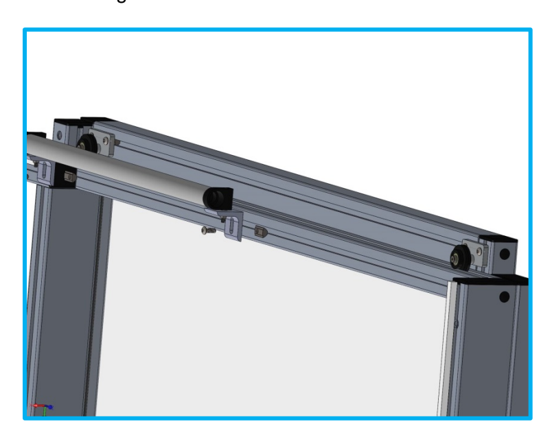
Figure 4 - Auto Closing Assembly Header Mount Exploded

Attach the Auto Closing Assembly to the Header Mount on the sliding door using 2 x M6 16mm Screw and 2 x M6 T-nuts as seen in Figure 4. Tighten the 16mm Screws with the Allen Wrench, being careful not to over tighten. To ensure smooth operation ensure that the piston is level and that all attachment points are in alignment.