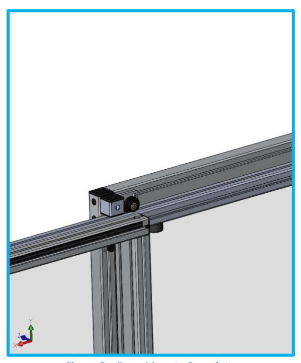
Figure 3 – Door Mounts Complete