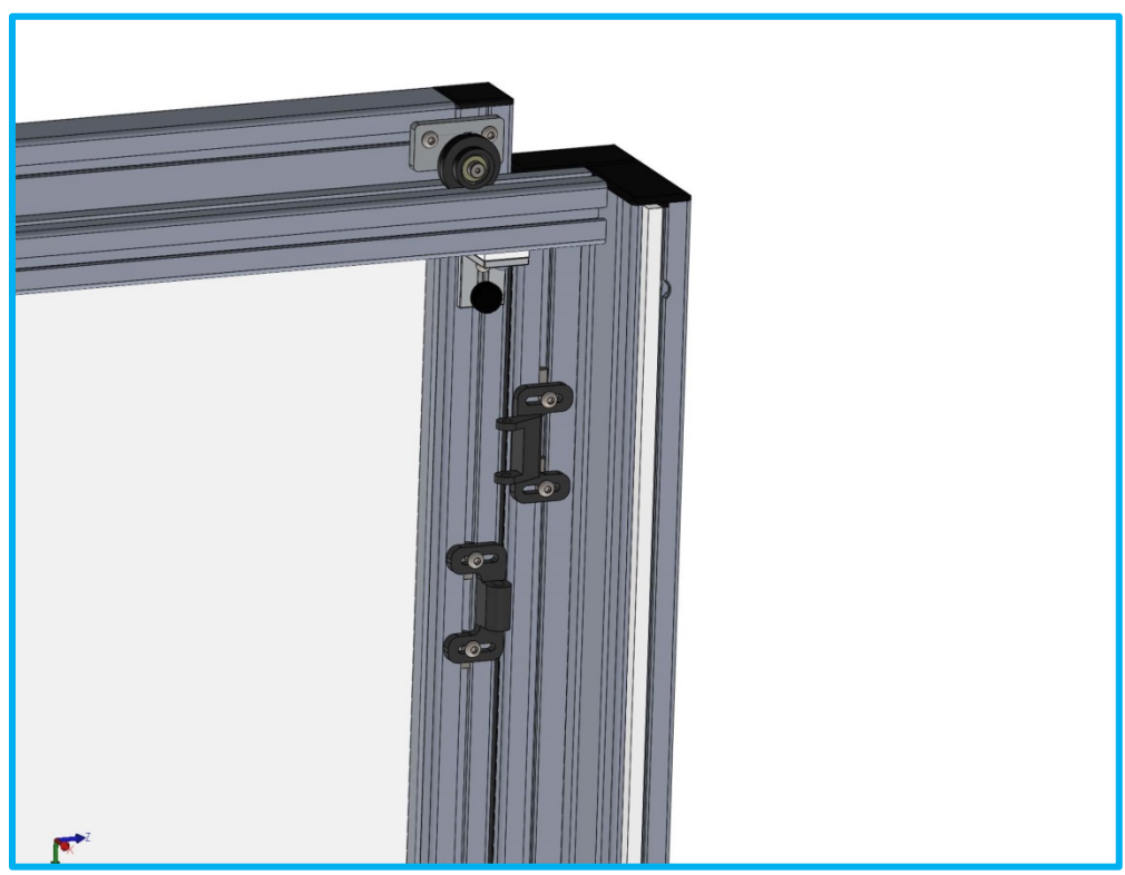
Figure 1 – Offset Closing Clasps

The Tate Sliding Door features closing clasps. To ensure proper sealing when utilizing the Auto Closing Assembly, these clasps will need to be offset. Using an Allen Wrench, loosen the screws attaching the clasps and slide one of the clasps offset from the other to disengage them.