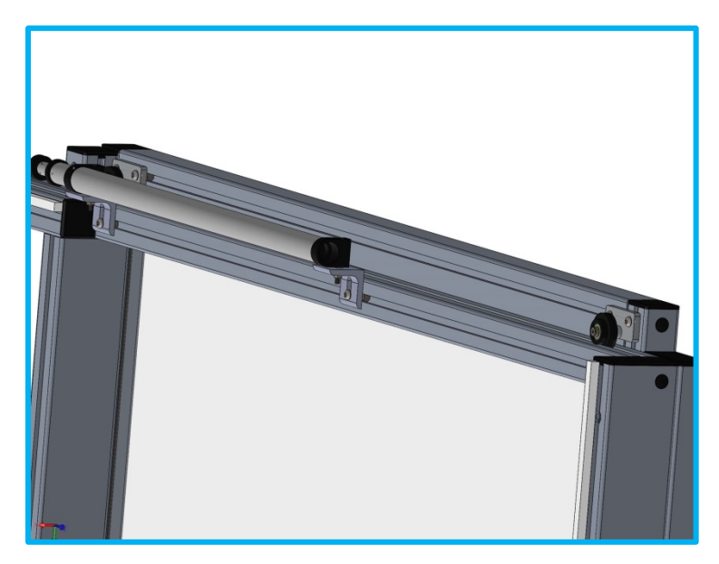
Figure 5 - Auto Closing Assembly Header Mount Complete