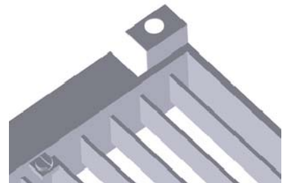
Support Tabs allow for suspension from pedestal head for panel independent mounting, optional screw down mounting.