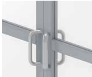
Ergonomic angled handles